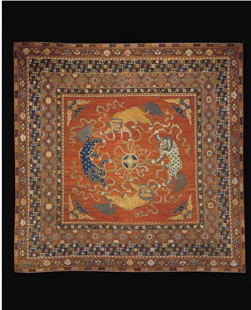
Fig. 16. The Abadjian Four Lion-Dogs dais cover. Western China, Ming dynasty, Tianqi period (1621–1628). 495 x 490 cm, wool pile on a cotton foundation. Private collection.

It should be noted that dragons, one of the most important symbols in Chinese art, appear only rarely on royal carpets of the Kang Xi period. According to sinologists, this is because the dragon with five claws, the imperial emblem, was not used to decorate items that were placed on the floor and, hence, liable to be trampled upon. 76