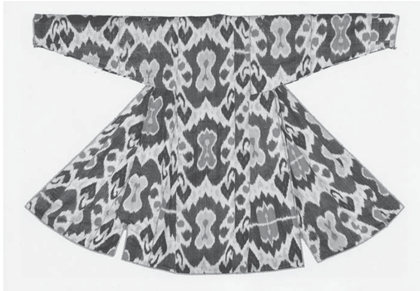
Fig. 2. Uzbekistan. Woven ikat (silk warp and cotton weft) chapan (coat). Late nineteenth century.

The multitude of motifs and patterns seen in Central Asian ikat textiles suggests different places and times of production. However, the scarcity of bodies of firmly dated materials makes precise attributions difficult. 26 It is generally accepted that ikat textiles showing smaller motifs and six or seven colours date to the first half of the nineteenth century, while those showing larger motifs date to the late nineteenth century. 27