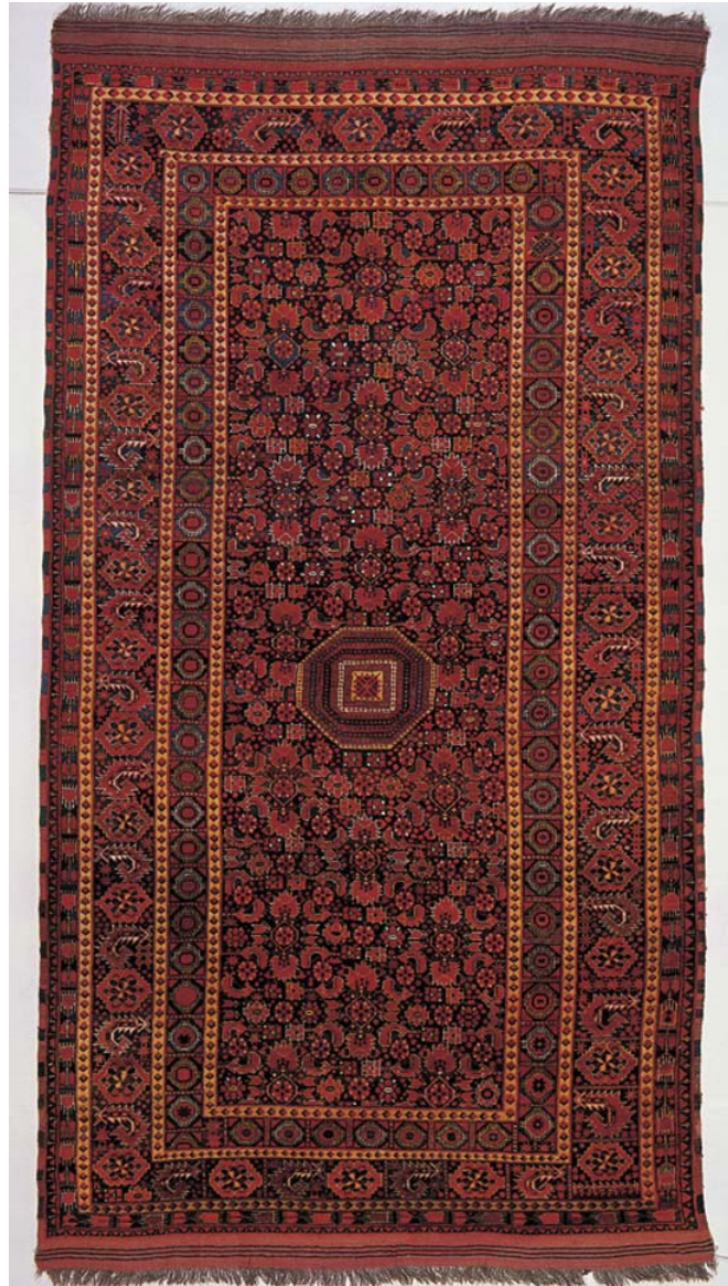
Fig. 13. Beshir carpet. Second half of the nineteenth century. 3.73 x 1.95 m.

open-on-left knot with a depression (Fig. 13). Living in the Uzbek environment encouraged the emergence of features characteristic of more eastern territories, among which should be mentioned the muted colour palette typical of the Uzbeks and the Kyrgyz-Khydyrshas and a limited number of borders with simple geometric ornaments. 62