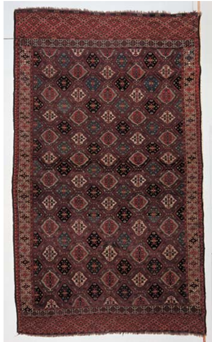
Fig. 10. Chaudur carpet. Early nineteenth century. 3.78 x 2.21 m.

asymmetrical open-on-right and open-on-left knots, as well as symmetric ones sometimes combined with specific methods of irregular weave (offsetting, packing knots, etc.); some groups used wefts of different material and colour, and individual manners of finishing the sides and the ends. 58