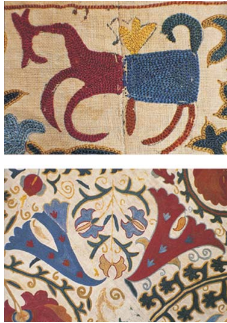
Fig. 1. Bukhara. Two details from karbās (silk on cotton) sūzanīs . Mid-nineteenth century.

Bukhara alācha featured well-coordinated multicoloured stripes of varying widths, with a dark, usually blue weft. By the end of the nineteenth century Bukhara alācha had ceased to be made. In nineteenth-century Samarkand, however, good-quality striped alācha was the main type of woven product. Its pattern consisted of fairly narrow white, red and dark blue stripes called qaraqāsh ('black eyebrows' in Uzbek); another pattern consisting of thin alternating stripes forming a chain was known as gajdumak , after a locality 40 km from Bukhara. In ancient times the zandān-īchī fabric, which originated in the village of Zandana not far from Bukhara, was made from silk, but by the Middle Ages it had begun to be made from cotton, and in the period covered in the present volume it continued to be a cotton-based product.