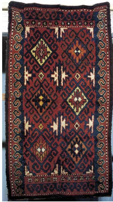
Fig. 12. Uzbek julkhyr . Nineteenth century. 207 x 115 cm, grey wool, mixed with white and brown.

reveals an unusual constancy in tribal decoration and weaving techniques. Changes were very rare and occurred only when a tribe switched to the mass production of carpets for urban and particularly foreign markets. A typical example of this phenomenon is found in the carpet-making practices of the community of the central Amu Darya, a supplier of floor carpeting to the bazaars of Bukhara, Transoxania and Khurasan, and later to Russia and Western Europe.