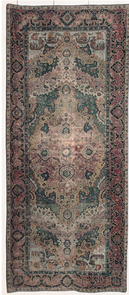
Fig. 8. The Potemkin ‘Portuguese’ carpet. Khurasan. Late sixteenth century.

fourteenth century and, as certain features of technique and ornamentation suggest, brought with them skills that had been influenced heavily by the Turkmens.