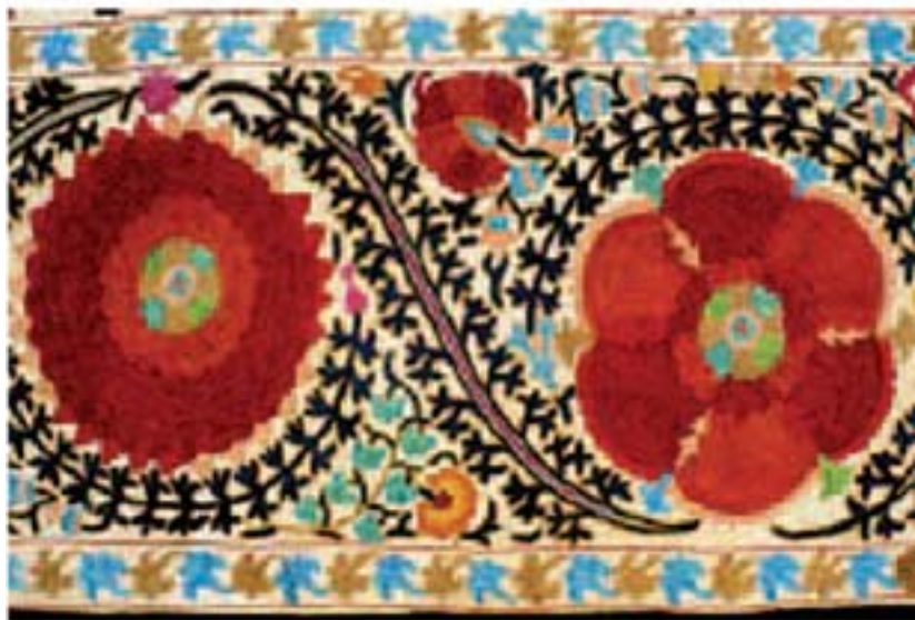
Fig. 3. Bukhara. Embroidered karbās (silk on cotton) sūzanī and detail. Mid-nineteenth century.

including Bukhara and Nur-ata, and those made in eastern Uzbekistan and Tajikistan, including Tashkent and Pskent. In the broadest sense, embroideries made in western and central Uzbekistan display naturalistic floral forms and those made in eastern Uzbekistan and Tajikistan show repetitions of large disc-like forms. A single sūzanī embroidery made in any one of the towns and cities between the eastern and western areas of production