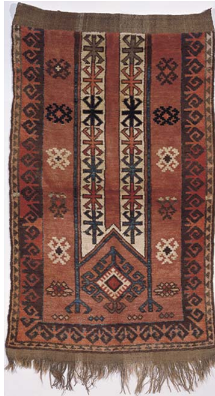
Fig. 15. Kyrgyz rug ( eshik tysh ). Nineteenth century. 162 x 95 cm, brown wool.

yurts – made large numbers of wall bags and door rugs, whose decoration reveals a more independent character and whose range of colours is characterized by its red and dark blue tones (Fig. 15). 67