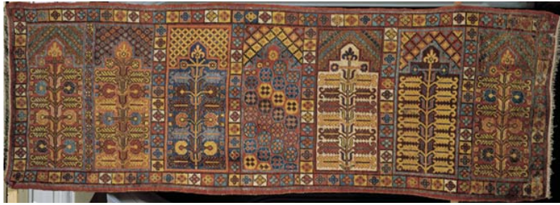
Fig. 14. East Turkistan, Khotan. Saf carpet. First half of nineteenth century. 290 x 100 cm, white cotton.

courtyards and rooms in Central Asian homes. Quite often one also finds rugs for covering seats, saddle rugs and large square-shaped rugs presumably intended for ritual purposes. 64