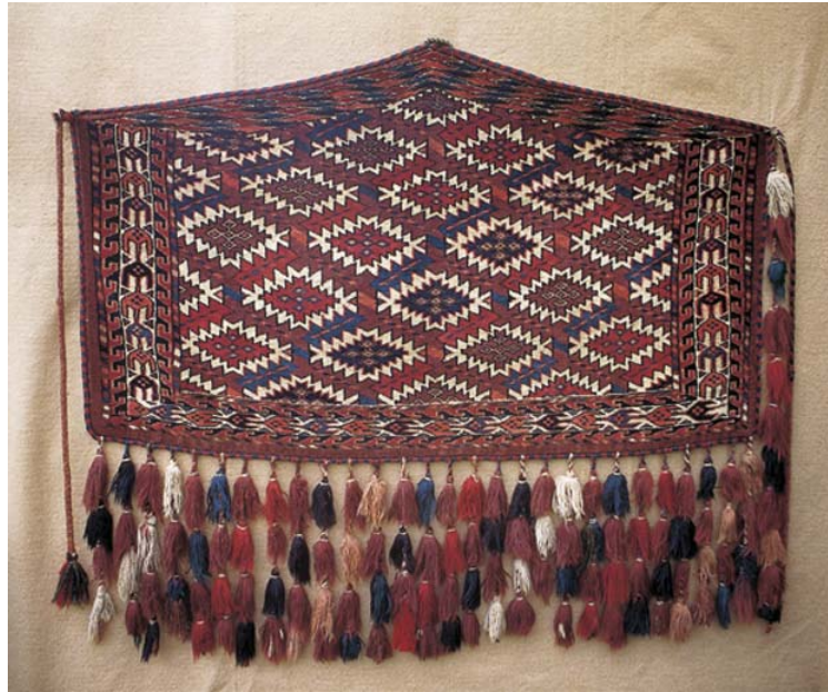
Fig. 7. Turkmenistan. Turkmen asmalyk in woven wool. Late nineteenth century.

production of alācha-i gajdumak , a multicoloured cotton fabric with narrow stripes of yellow or dark red. Samarkand was known for mushk-i zafar , a fabric of yellow and blue stripes, and Khwarazm for cotton fabrics of narrow red, green and light purple stripes. 43