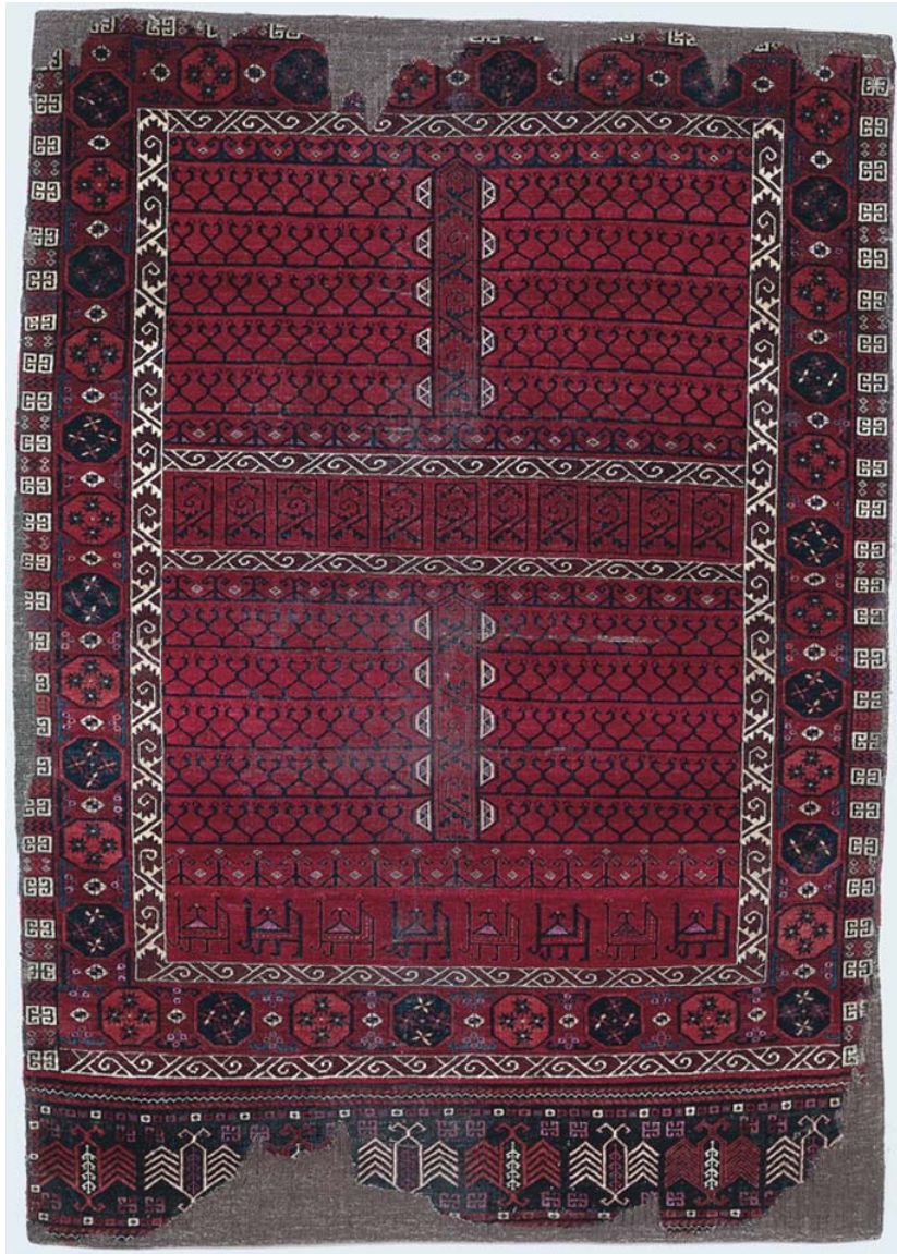
Fig. 11. Turkmenistan. Ensi door rug: Sālor Turkmen.

the universe from the lower regions of zamīn (earth) to the vaults of the heavenly firmament that crown the composition (Fig. 11). 60