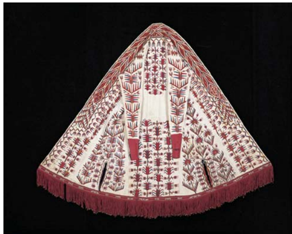
Fig. 6. Turkmenistan. Rare embroidered white silk chyrpy . Mid-nineteenth century.