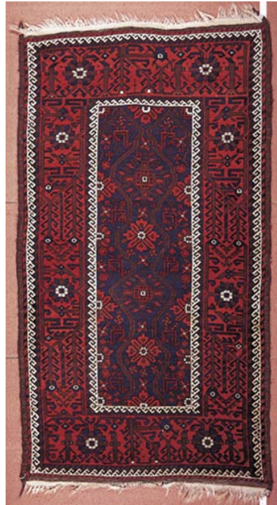
Fig. 9. Baluchi rug. Second half of nineteenth century. 168 x 91 cm.

subjectmatter (Fig. 9). As regards production techniques, the carpets were woven using mostly the asymmetric open-on-left knot, though some groups also used asymmetric open-on-right and symmetric knots. The warp, weft and pile were made from wool of the highest quality; the pile could often include silk, cotton and camel hair.