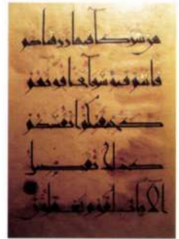
▲ A page from a 10th Century copy of the Koran, Islam's most sacred text. It is written on paper, by then widely available in Western Asia.

The invention and manufacture of paper directly paved the way for the invention of printing. Printing from blocks of wood onto paper first occurred in China in the Seventh Century CE. Buddhist monks were largely responsible for this as they needed many more copies of their sacred texts than copiers could produce. The earliest known printed book is the Buddhist Diamond Sutra , produced in 868.