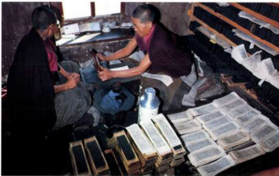
◀ Two Buddhist monks using wood blocks to print religious texts in a monastery in the Everest region of Nepal. It is probably for this purpose that printing first developed in China.

Korea was the first country to which printing spread from China, around 700. From there it was introduced by Buddhist monks to Japan. In the mid-Eleventh Century printing by movable type also originated in China. Movable wooden type dating from about 1300 has been found in the city of Turfan in Xinjiang. It was introduced there from China following the Mongol conquest of the region. The Mongol armies passed on further westwards, overrunning Russia, Poland and Hungary from 1240 to 1242. It is possible that before he invented movable type in Germany in 1455, Johann Gutenberg had heard about its use further eastwards.