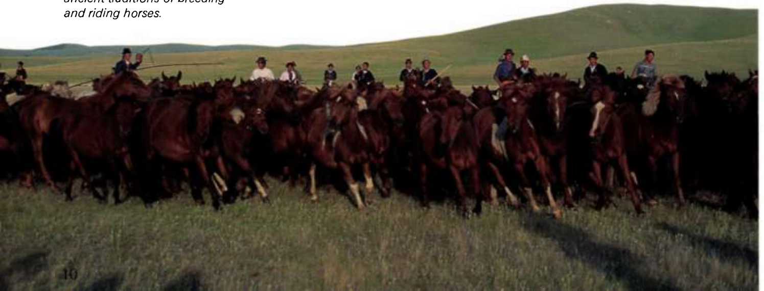
▼ Mongol nomads rounding up their horses. This is a modern continuation of their ancient traditions of breeding and riding horses.

The domestication of the Bactrian camel took place in the Second Millenium BCE at the hands of the nomads of Central Asia. The Arabian camel was domesticated at about the same time. Both types, the