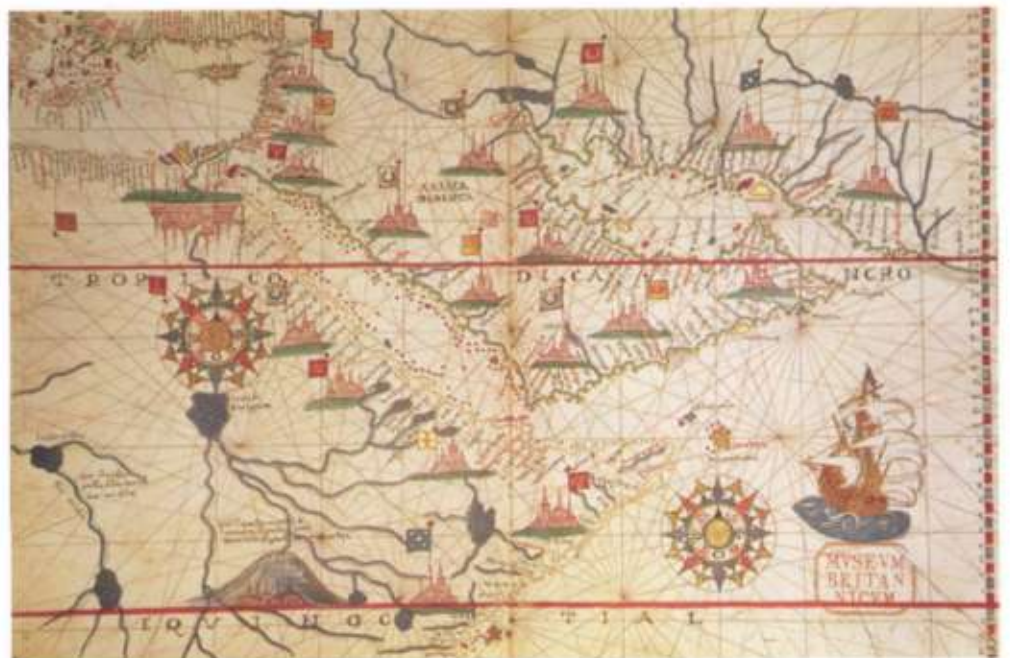
▶ Page from a portolan atlas c. 1650 showing the Arabian Peninsula and the eastern Mediterranean.

In the mid-Twelfth Century detailed information on India, China and North Africa was passed to the Europeans through the patronage of two kings of Sicily – Roger II (1127-54) and his son William I (1154-66). With their backing, an Arab scholar from Morocco called al-Idrisi (1100-66) produced a complete description of the world as then known to the Muslims. This information was set out in a series of seventy maps with a written description in a volume known as the Kitab al-rujari (The Book of Roger).