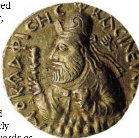
◀ Gold coin minted around 1st to 2nd Centuries CE by the Kushan king Wima-kadphises. The Kushans controlled a large empire in Central Asia from 1st-3rd Centuries and greatly encouraged trade on the Silk Route.

Later, the use of paper money, first developed in China in the Eleventh Century CE, was adopted by the Mongols after their conquest of China in 1264. They introduced the idea throughout their massive empire, including the lands of Central Asia and Iran.