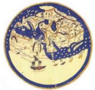
▲ One of the maps from the Kitab al-rujari ( The Book of Roger ).

In the area of navigational instruments, the introduction of the mariner's compass to Western Asia and Europe at the beginning of the Thirteenth Century marked a significant stage, for the first time permitting accurate directions for navigation. The magnetic compass had existed in China for a number of centuries before, but it was only late in its history that it came to be used for navigation at sea, sometime between 850 and 1050. The Chinese were active in the Spice Route trade, although their junks were often sailed by Koreans, and the compass seems to have reached Islam and Europe at about the same time through nautical contact with China. The first mention of a compass in European writings occurred in 1190 and in Arabic writings about 1232.