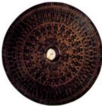
▲ A Chinese geomancer's compass used to make sure a building faced in a direction favourable to good luck. The navigational compass developed from this earlier use.