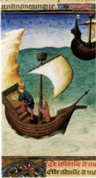
▲ This illustration from the 15th Century Livre des Merveilles is the first to show a compass in use in European shipping.