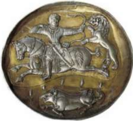
▲ 3rd Century CE Persian silver gilt dish. It shows a scene of a man hunting on horseback. The horse's tack, including its reins and stirrup, is carefully depicted.

The establishment of overland trade routes was, of course, dependent on people's ability to travel long distances and to carry a reasonable quantity of trade goods with them. The different types of countryside – hills, mountains, rivers and vegetation – all influenced the types of routes chosen, but it was animals, such as horses and camels, that really opened up the opportunities for people to travel longer distances and over longer periods. Until the railways of the Nineteenth Century, this was the means that enabled large scale overland trade to take place.