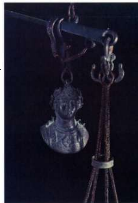
▼ A superb bronze weight in the form of a human bust, attached to a Roman steelyard scales.