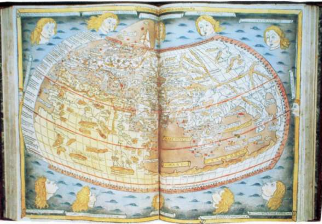
◀ A map of the world dating to 1486, based on Ptolemy's Geography.

Al-Idrisi's knowledge and that of earlier Arab geographers was partly based upon Persian-Sasanian, Indian and Greek sources. The influence of Sasanian geographical knowledge can be seen in many areas, such as the name for the Indian Ocean which the Arabs called bahr al-fars (the Persian Sea) following Sasanian examples. Indian and Greek geographical works were translated into Arabic, including those of the Graeco-Egyptian geographer, astronomer and mathematician Claudius Ptolemy (c. 90-170 CE). His monumental work, the Geography , was an early attempt to map the known world and provided the basis for much later Arabic cartography.