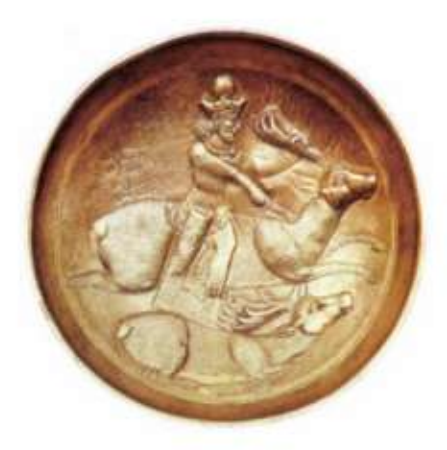
▲ This Sasanian gold plate with silver relief shows the 4th Century King Shapur II hunting.

No longer protected by the Han, the techniques of sericulture and silk weaving had slowly spread westwards, although China continued to produce the best quality silken twine and material. Using Chinese thread, Sasanian and Sogdian silk weaving industries flourished from Central Asia to Mesopotamia. Few examples of these silks still survive but some made their way to Europe, where they have been found wrapped around sacred relics, while other fragments have been discovered at Buddhist cave sites in the Tarim Basin. Their motifs and style heavily influenced the later designs of Chinese, Byzantine and Muslim cloth.