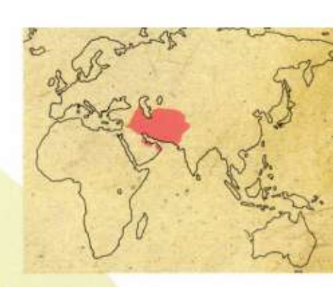
▲ A map of the Sasanian Empire in 531 CE when it was at its greatest extent.