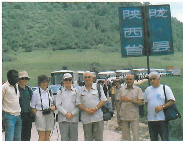
Members of the International Silk Road Expedition arrived in Longxian County, Shaanxi Province, to make a field study in Longshan mountainous area.